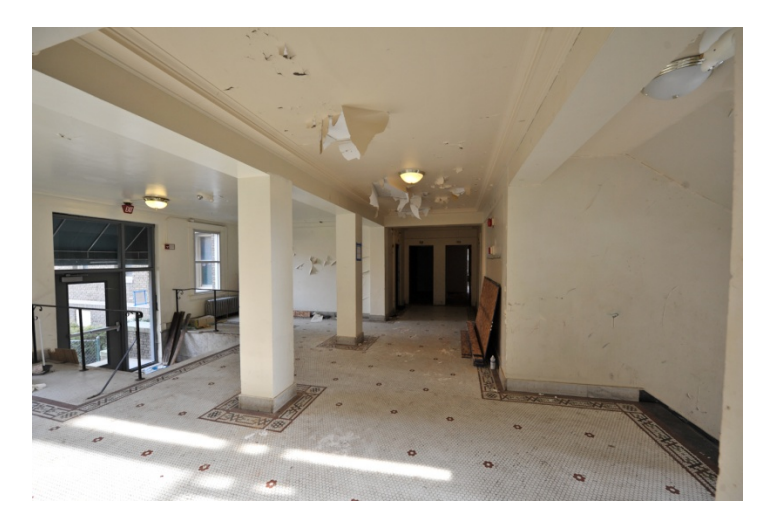
Lobby - before